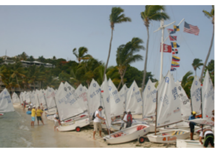
It ain't bad! Trust me!