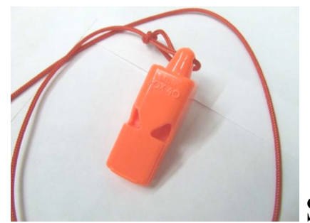
See at optistuff.com

We did a study of the top whistles and the Fox 40 pea-less whistle gave out the loudest sound of them all. Heard everywhere from the Olympics to NFL and NBA games, this bright orange color whistle is easy to locate on your life jacket. At 115 decibels the loud shrill helps assure you will be located when in distress. The pea-less design will never lock up, will never fail in water (you blow it clear) and never fail in high humidity like cork peas, which can 'lock up' even if blown too hard. It can be secured on a sailor's life jacket with the attached lanyard.