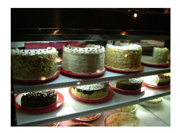
"Life Is Short, Eat Desert First" Is Still a McLaughlin Motto! It's easy at True Confections in Vancouver, BC