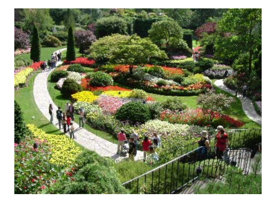
Butchart Gardens Vancouver Island

4737 Adams Road, Chattanooga TN 37343 (423)875-0740 Fax (423)875-4011 WWW.optistuff.com